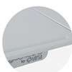
PENCIL GROOVE ON WORK SURFACE