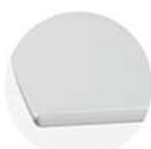
BLOW-MOLDED TOP COVER WITH CASCADE EDGE ON USER'S SIDE