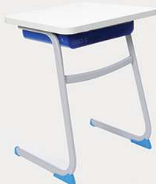
AL-1003B + AL-C2