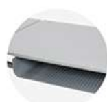
OPTIONAL SOLID STEEL SHEET BOOK RACK (AL-C2)